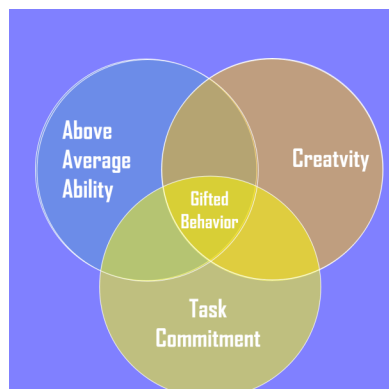
RENZULLI'S THREE RING MODEL

Approximately 2,500 students apply to the three after school centers and of those 900 are selected. The evaluation process is holistic and includes cognitive assessments, interviews, nominations and academic performance. Participation in the after school centers begins in 7th grade and in 9th grade students may apply to PAF where admission is based on committee evaluation and includes quantitative and qualitative criteria inspired by Renzulli's three-ring model. This includes GPA, standardized test scores, awards, extracurricular activities, leadership roles and social and community projects. Students are evaluated in the context of their life circumstances. Character traits of curiosity, critical thinking and motivation are also assessed.